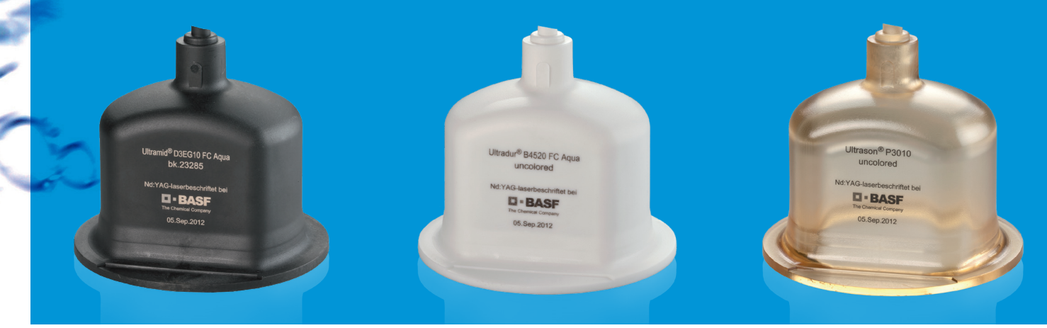
Fig. 3: Ultrasim® Fatigue Testers made from Ultramid® D3EG10 FC Aqua (left), Ultradur® B4520 FC Aqua (middle), Ultrason® P3010 (right)

In this way, extensive data has already been collected in relation to the products in the Aqua® portfolio. This data is constantly being expanded with further short-term and long-term tests. A pre-requisite for acquiring this knowledge about fatigue performance and endurance strength is to have universal test specimens whose behavior can be predicted virtually and verified experimentally. This is why the Ultrasim® Fatigue Tester , a particular BASF test specimen, is currently being used to systematically build up additional knowledge (see Fig. 3).