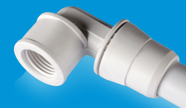
Fig. 1: Fitting made of Ultrason® P3010

An overview of the entire portfolio is given in Table 1.