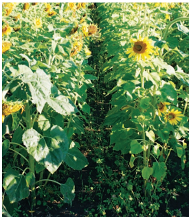
Sulfentrazone PRE (4.5 oz/A)