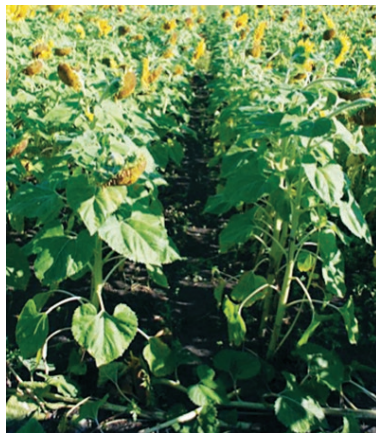
Beyond Herbicide (4 oz/A) + NIS (0.25% v/v) + AMS (17 lb/100 gal)

BASF Field Trial (2010). NDSU, Fargo, ND.