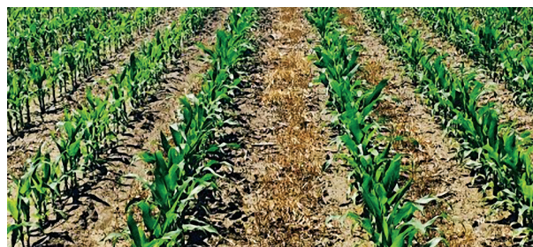
Status Herbicide (5 oz/A)†