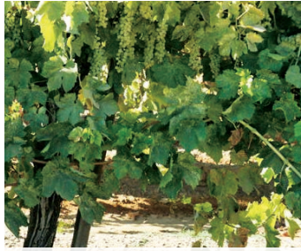
Nealta Miticide 13.7 oz/A