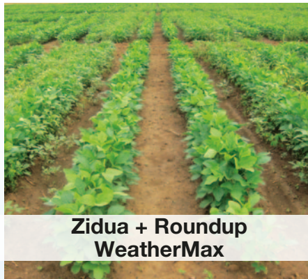
Zidua + Roundup WeatherMax

1.5 oz Zidua PRE followed by a Zidua 0.5 oz + Roundup WeatherMax 22 oz POST.