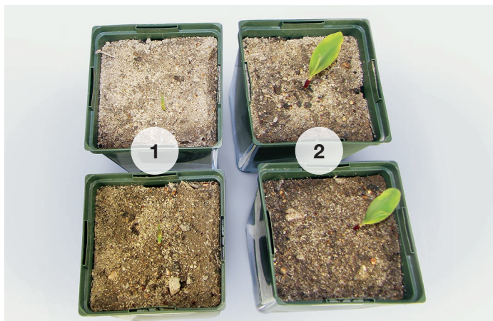
1. Untreated, Inoculated 2. Xanthion fungicide (7.2 fl oz/A), Inoculated. Plants inoculated with Rhizoctonia solani at planting.

Xanthion fungicide Component B provides immediate chemical control once in soil solution; while the biological ingredients in Xanthion fungicide Component A grow and develop on the roots over time to provide additional protection against soil-borne pathogens.