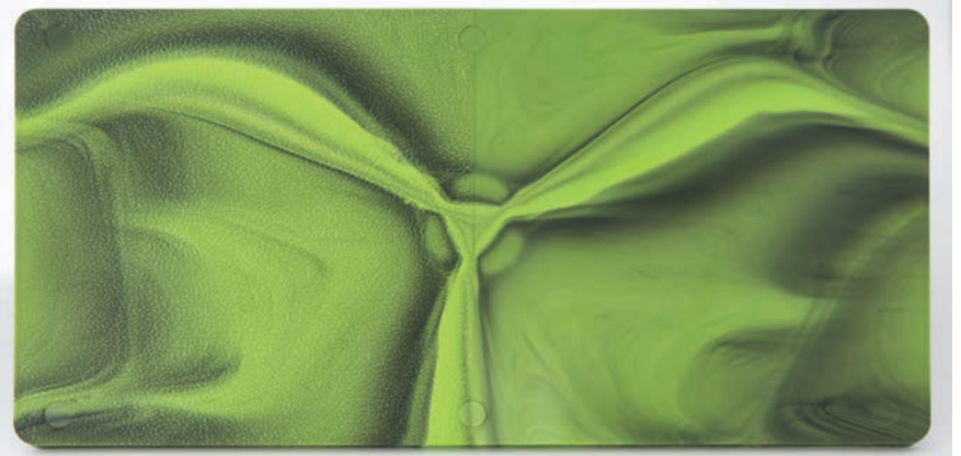
Fig. 5. The surface finish of the mold cavity influences the appearance of the samples. Highly polished surfaces strongly accentuate contrasts. Textured surfaces leads to a matt appearance

top lids and smartphone covers, as fashion accessories, e.g. buttons, as decorative elements in vehicle interiors, e.g. caps and covers, and as parts for toys. For many of these applications, the polymers should at least have a food contact (FC) classification, as is the case for Ultradur B4520 FC, a polybutylene terephthalate (PBT) supplied by BASF. In contrast, various polyamides (PA) such as the Ultramid Deep Gloss or Ultramid Vision family from BASF are suitable for automotive interiors.