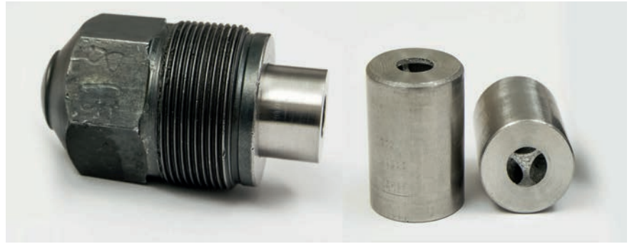
Fig. 4. Nozzle inserts made by 3D printing offer designers huge freedom of design. Flow-optimized channel geometries in the nozzles can be used to make the melt swirl on its way into the mold. This also supports the creation of rotationally symmetrical patterns

Marbled molded parts are chiefly used for decorative purposes in the consumer goods sector. They serve as household objects, e.g. bowls, plates, cups, handles, and covers, as well as lap-