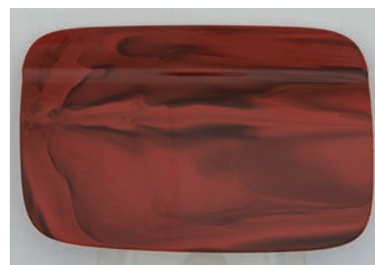
Fig. 3. Molds fitted with hot runners and tunnel sprues can be used to produce very attractive patterns. As these molds are not injected from a central point, the marbling streaks vary in their pattern

Additive manufacturing processes offer a very high degree of design freedom over the production of nozzle inserts. In particular, they can be used to create channel geometries that cause the melt to swirl as it flows into the mold (Fig. 4). This affords a way of producing mirror-image patterns and rotationally symmetrical patterns. The swirling of the melt is clearly visible in the pattern shown in the Title figure and Figure 1. Such patterns were previously not feasible with conventional processes.