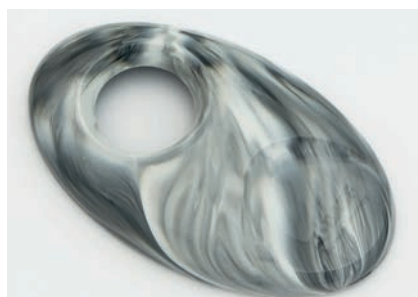
Fig. 2. Not only flat molded parts but also attractive three-dimensional articles can be produced with a marbling effect. Correct dosing and the combination of "contrast" batches and coloring component during production are also important