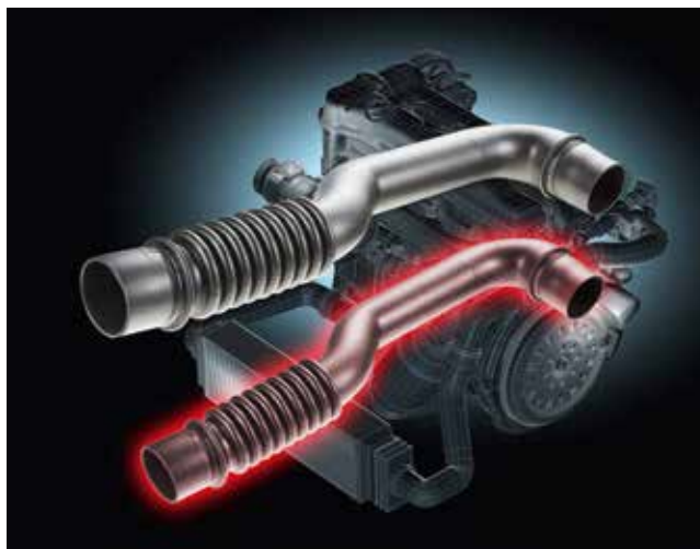
Fig. 8. One of the most heat-resistant, polyamide-based injection molding materials on the market is now also available as a blow molding type: Ultramid Endure D5G3 BM can withstand temperatures up to 220°C in permanent operation

In this area, polyamides are finding their way into applications that used to be dominated by heat-resistant high-performance plastics. Slowly but surely, charge air temperatures of high-performance engines are moving towards the 230-centigrades-mark – while, ten years ago, these temperatures were usually around 200°C. One can assume that the Euro 6