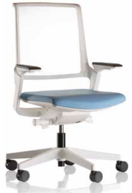
Fig. 7. One of the first serial products of the Ultramid SI series is the swivel office chair MOVYis3 created by BASF, together with furniture producer Interstuhl. The backrest is made of Ultramid B3EG4 SI, combining valuable surface appearance, sleek component design and high load-bearing capacity

Over the past years, developers and product designers have shifted their focus on component surfaces. Demand has increased for plastics that do not have to be treated after demolding. Here, as well, the latest polyamide variants can help to reduce costs – as is the case with the back-