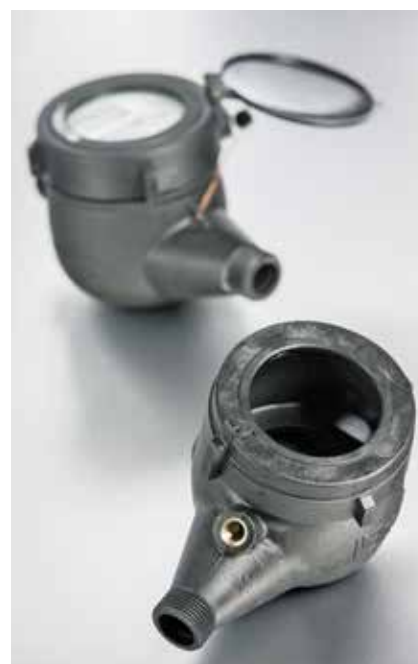
Fig. 2. Ultramid D3EG10 FC Aqua is an example of a polyamide that can be used for components in contact with drinking water, thanks to its good chemical and hydrolysis resistance. The Aqua variant is suitable as a substitute of lead-containing alloys in water meter housings, for example

cesses, while a material needs to be tested and/or approved only once in a central location, and can then be supplied from local sources at high and homogeneous qualities. However, defining universal quality standards for all regions is extremely demanding: these standards must consider, e.g., local differences in raw material sources, differing climates, or the differences in process equipment available in the respective locations. Today, some large suppliers like BASF offer products that meet these requirements, while they work intensely to enhance their range of global products.