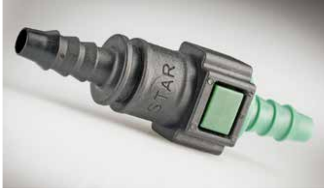
Fig. 6. Bio-based polyamides help enhance the raw material basis, and complement the existing PA portfolio. A. Raymond's quick connectors are one example of a successful application

polyamides more expensive, in most cases, than their competitors based on crude oil. Often, the question is ambiguous, or hard to answer, whether polyamides based on renewable raw materials are in fact more sustainable than other types – in particular, if considering factors such as landscape consumption, use of fertilizers and water, transport, working conditions or the competition with food production. Variations in the qualities of the natural raw materials can cause difficulties in the production of the polymers, and, also subject to the respective crop yield, cause severe variation in the cost of the raw material. In some cases, suppliers replace established materials that have, for years, proved well-suited for demanding applications. After all, customers must be convinced of the new products. At the same time, standards and specifications may be a huge challenge for the new class of materials to meet.