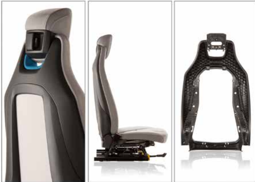
The backrests of driver and front passenger seats in the BMW i3 feature injection molded seat structures of a special polyamide. Their high surface quality makes it unnecessary to varnish the visible parts

Polyamides have gone through a remarkable development in recent years. On the one hand, they are under pressure from other polymer materials increasingly entering the domain of engineering plastics. On the other hand, new, highly-specialized PA types are opening up applications hitherto reserved for high-performance materials. Continuous fiber composite materials are experiencing a dynamic development, polyamides from renewable raw materials are constantly on the increase.