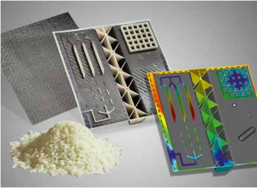
Fig. 3. Applying laminates and tapes, complex components can be produced by injection molding. These parts are reinforced mechanically by continuous fibers sitting at precisely defined spots. The figure shows a multifunctional test specimen of 360 mm x 360 mm size, suitable to reproduce numerous characteristics and challenges of composite production

sorption, high resistance to hydrolysis, and high stiffness (Fig. 2).