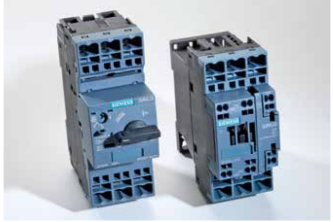
Fig. 5. Switchgears of Ultramid A3X make the electrical function permanently and highly reliable

or nitrogen, or metal hydroxides. One of the major flame retardants for polyamide 66 is red phosphorus. Thanks to its high efficiency, the retardant shows good fire behavior as well as excellent mechanical properties, even at relatively low filling degrees ( Fig. 5 ). BASF is enhancing their portfolio in this area. For example, a long-glass-fiber-reinforced A3X type has recently been made available, providing for high strength even at low temperatures, and low creep at high temperatures.