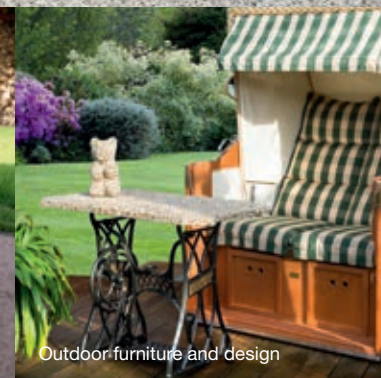
Outdoor furniture and design