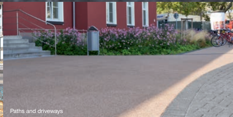
Paths and driveways