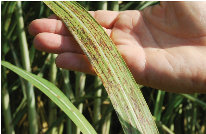
Sugarcane Brown Rust

2012.