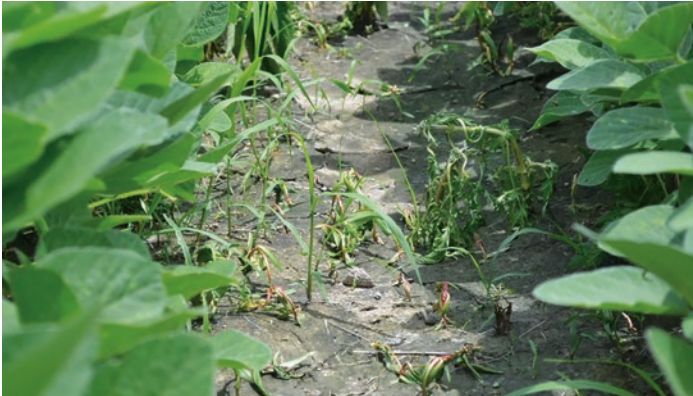
1. Glyphosate Only