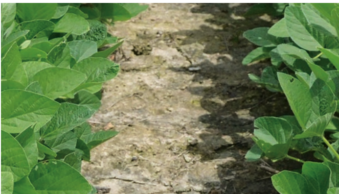
2. Outlook® Herbicide Plus Glyphosate

1. By using glyphosate alone in the postemergence herbicide application, a respray was needed for complete control. 2. The addition of Outlook herbicide with glyphosate in the postemergence herbicide application provides residual control. BASF sponsored research trial, Southern Illinois, 2015.