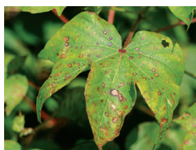
Stemphylium Leaf Spot