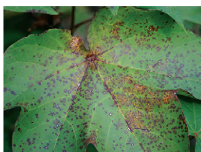
Ascochyta Leaf Spot