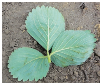
Nealta Miticide 13.7 oz/A