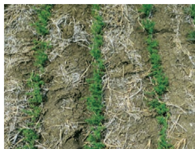
Obvius Fungicide Seed Treatment

2015 On-farm BASF Research Flax Trial. Obvius fungicide seed treatment 4.6 fl oz/A.