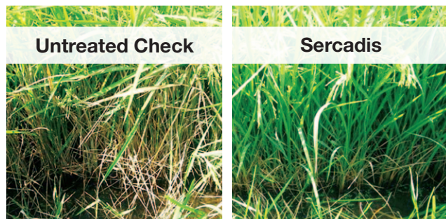
2011 BASF replicated small plot trial, Louisiana. Sercadis applied at panicle differentiation. Non-resistant sheath blight.